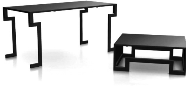
Figure 3: MK2 Trans furniture steel alloy table